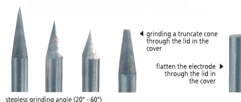
stepless grinding angle (20° - 60°)