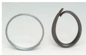
Mounting rings, metal and PVC.